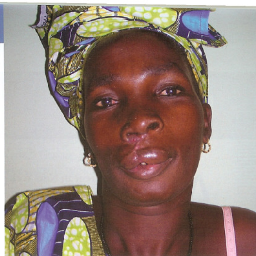
Two post-surgery patients treated by Medical Missions for Children’s mission to Centre Hospitalier Universitaire Gabriel Touré, Bamako, Mali, December 7-16, 2007.